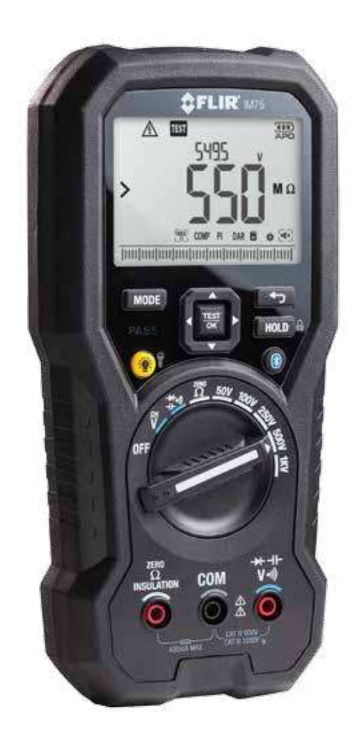
IM75 Features powerful worklights